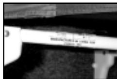
Need model sticker (Pieces are ok)

Dorel Juvenile Group, Inc. Consumer Relations Playard Recall P.O. Box 2609 Columbus, IN 47202-2609